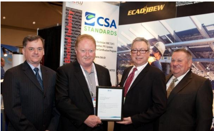
CSA Presentation to ECAO/IBEW-CCO in Toronto on Dec. 6, 2011.